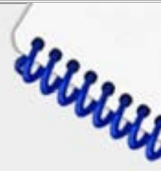
Plastic Coil/Spiral Binder 175-200 Maximum Pages Each